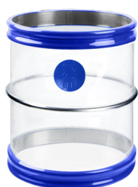
Stainless Steel Ring

Seeflex 020E connectors with rings have an approximate compression ratio of 5:1 and Seeflex 040E connectors 2½:1.